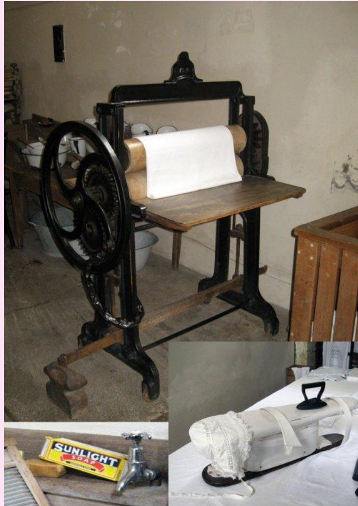
The dreaded mangle and Sunlight Soap! From the mangle and the dryer the laundry moved to the ironing. A polishing iron is being used for the collars. Starch was also used to great effect.

Once the washing had been completed, the linen was passed through the mangle several times to remove the excess water. The mangle consisted of a heavy pair of wooden rollers well known for catching unwary fingers. It was also used after the linen had been dried for pressing and smoothing to remove the creases from sheets and table linen.