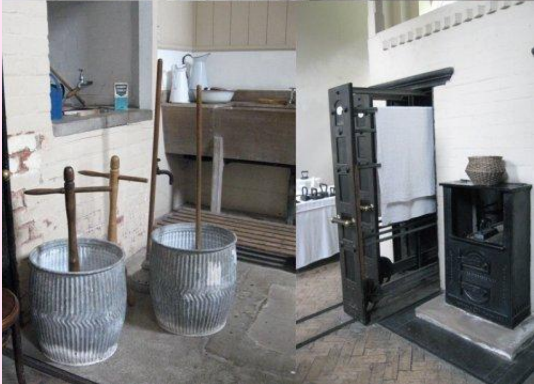
Irons, dolly tubs, drying oven and open oven for heating flat irons in the laundry.